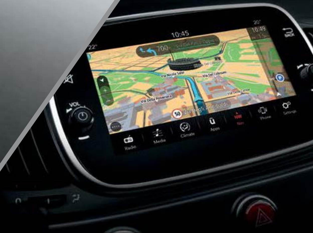
Navi 7" with Apple CarPlay / Android Auto™