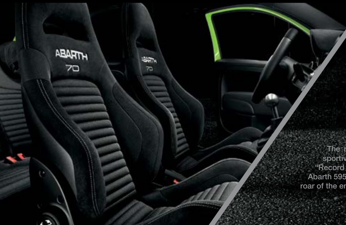
Sabell 70 GT cloth

The mechanical excellence of Abarth is what brings to life its sportive spirit. With the 180 HP T-Jet engine with 4-cylinders, "Record Monza" exhaust and red finished front fixed calipers. Abarth 595 Competizione is dedicated to those who love to unleash the roar of the engine.