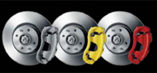
Non painted calipers (standard on 595) Yellow Red