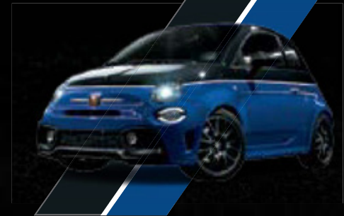
Scorpione Black / Blue Podio