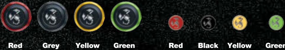
Red Grey Yellow Green Red Black Yellow Green