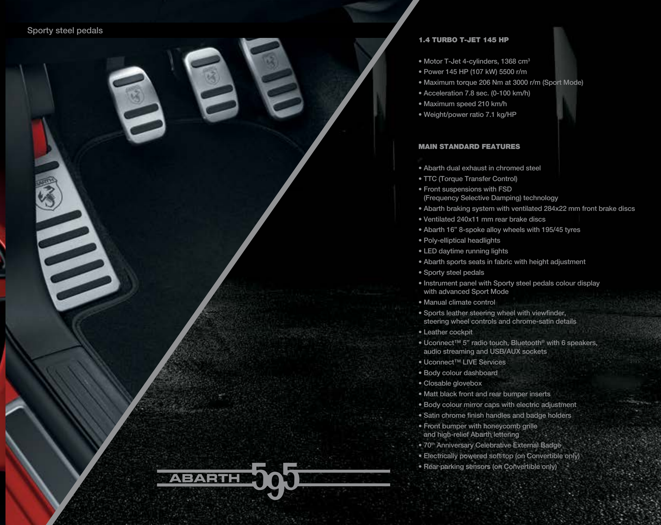
Sporty steel pedals