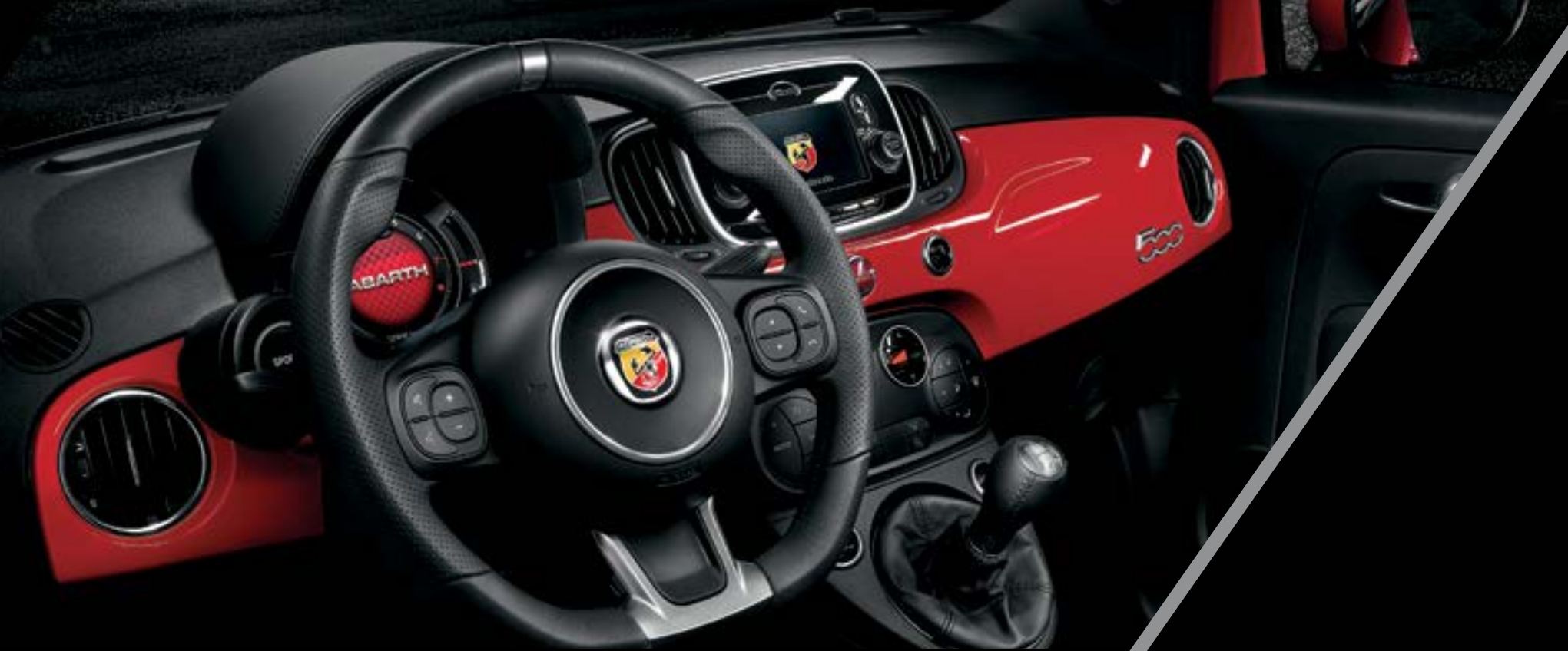
Body colour dashboard