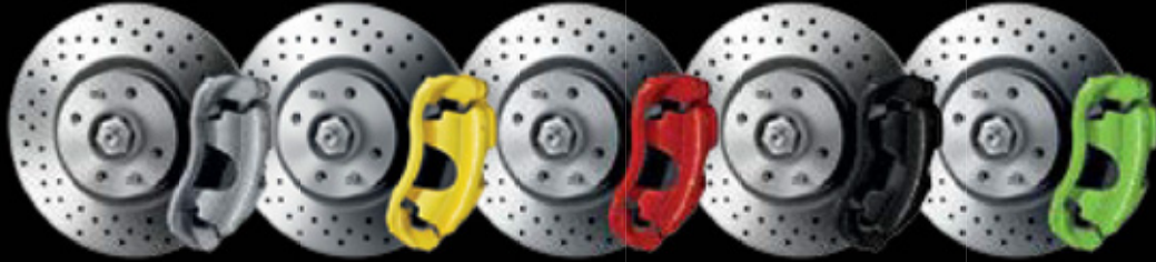
Grey (standard on 595 Turismo) Yellow Red (standard on 595 Pista) Black Green (available from January 2020)