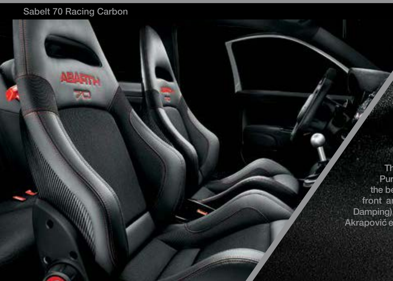
Sabelt 70 Racing Carbon

The symbol of the Scorpion's performance: Abarth 595 Esseesse. Pure power, pure performance. A car made only for those who want the best. Equipped with a 180 HP T-Jet engine with 4-cylinders, Koni front and rear suspensions with FSD technology (Frequency Selective Damping), white Racing Supersport 17" alloy wheels with 205/40 tyres, Akrapovič exhaust and the exclusive Navi 7". The heart of emotions beats here.