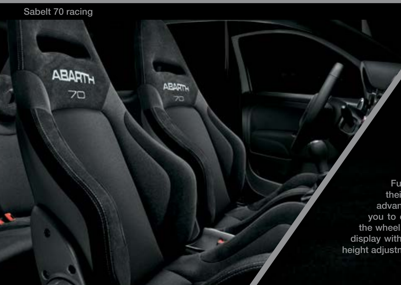
Sabelt 70 racing

Fun in its most pure form. It is made for those who love to test their limits of performance and then go beyond. Onboard take advantage of the exclusive Abarth Telemetry system that allows you to create personalised tracks and measure your performance at the wheel. All this plus sporty steel pedals, instrument panel with colour display with advanced Sport Mode and Abarth sports seats in fabric with height adjustment. Inspired by the track, in its name and its nature.