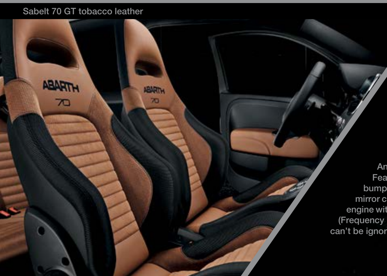
Sabelt 70 GT tobacco leather

An unsurpassable style that creates breathtaking emotions. Featuring leather sporty Abarth seats, body colour front and rear bumper inserts, tinted rear windows and chrome-brushed finish mirror caps. The performance element can never be forgotten, a 165 HP engine with Garrett Turbo and Koni rear suspensions with FSD technology (Frequency Selective Damping). Abarth 595 Turismo, a personality that can't be ignored.