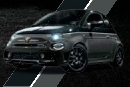
Scorpione Black / Record Grey