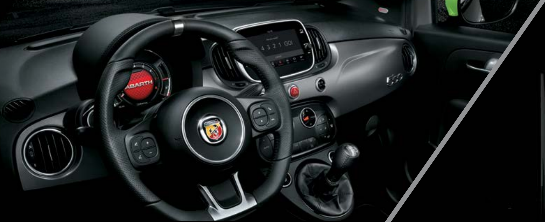
Matt grey dashboard