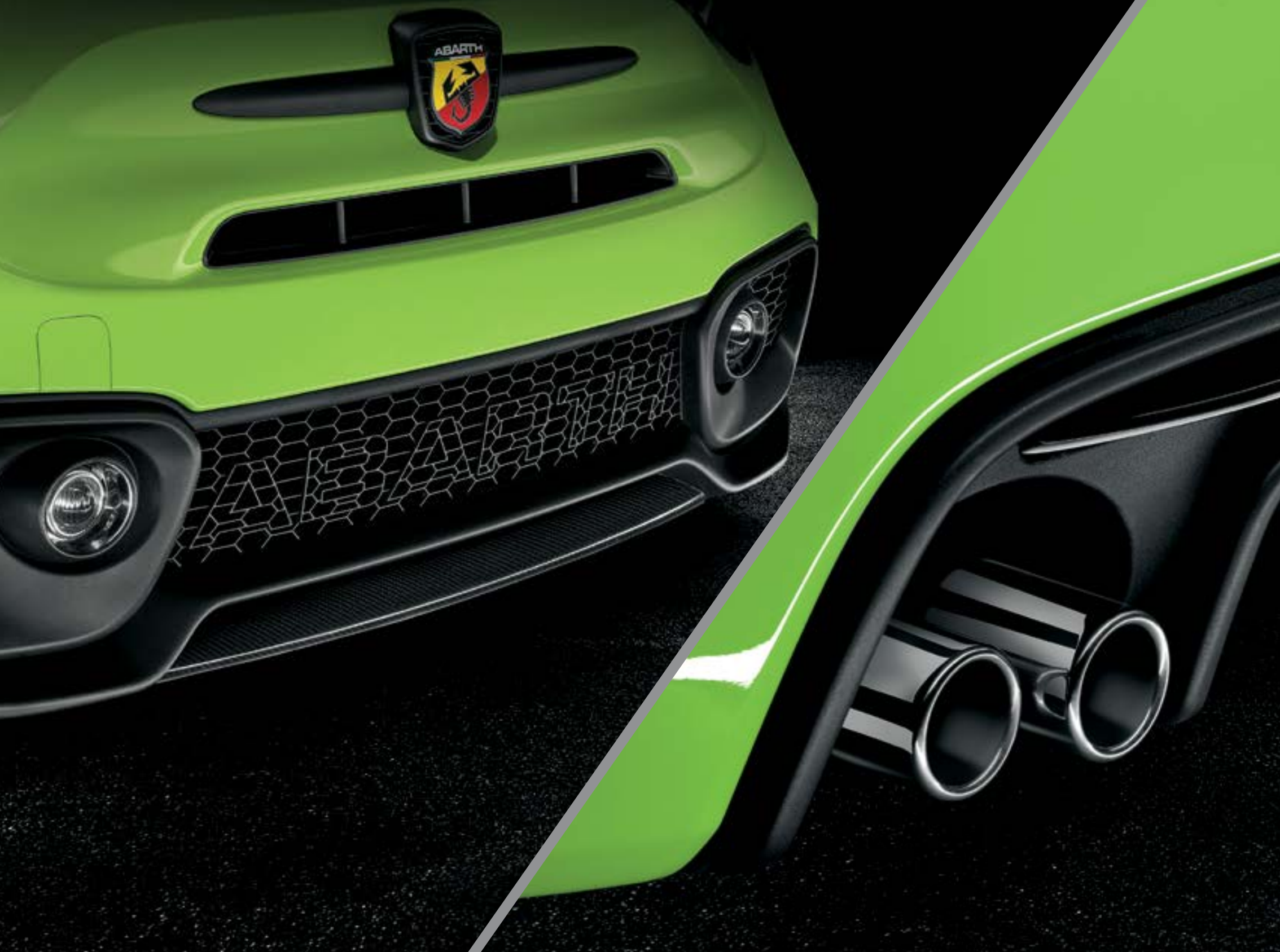
Front dam in carbon fiber