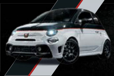
Scorpione Black / Gara White