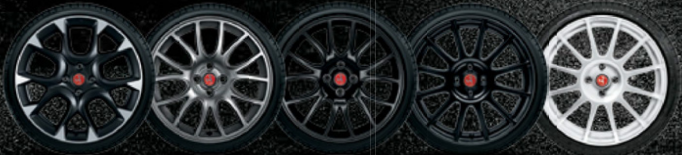
17" CORSA 17" FORMULA 17" FORMULA 17" SUPERSPORT 17" SUPERSPORT WHITE RACE