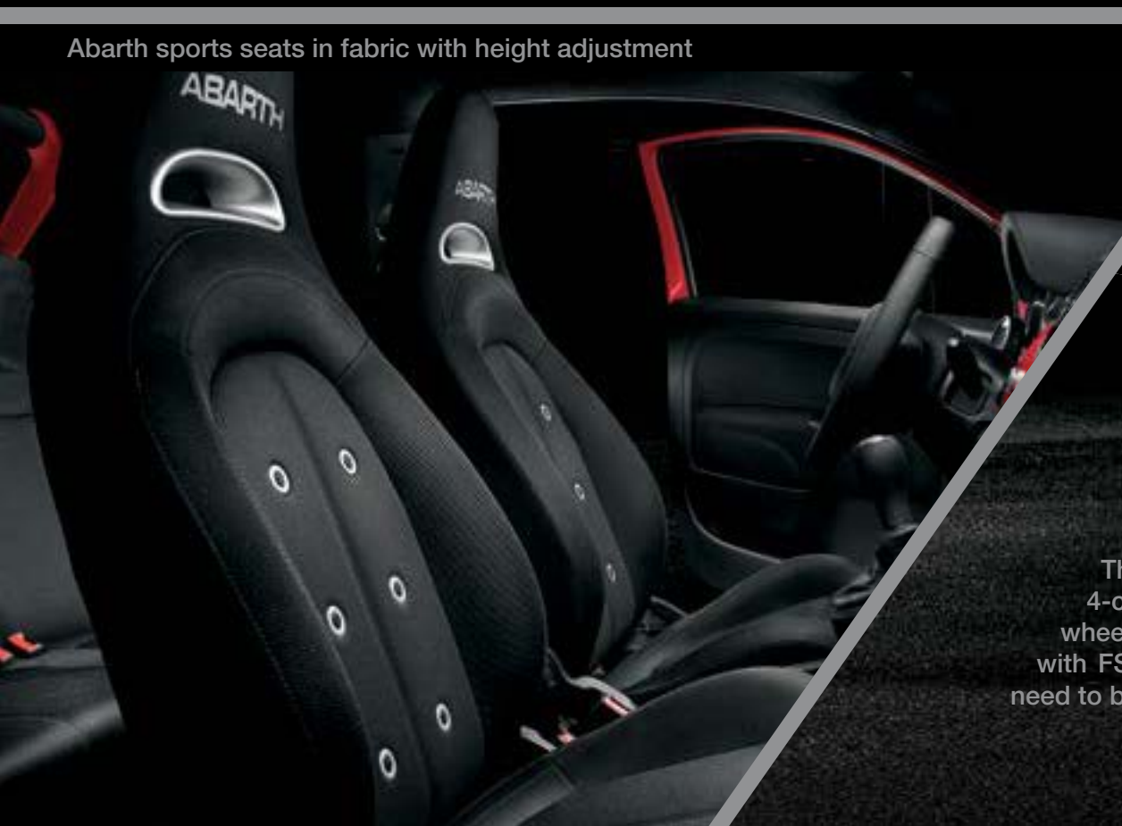
Abarth sports seats in fabric with height adjustment

The perfect Abarth, for the perfect start. A 145 HP motor T-Jet 4-cylinders, dual exhaust in chromed steel, sporty leather steering wheel with viewfinder, steering wheel controls and rear suspensions with FSD technology (Frequency Selective Damping). Everything you need to be stung by the Scorpion.