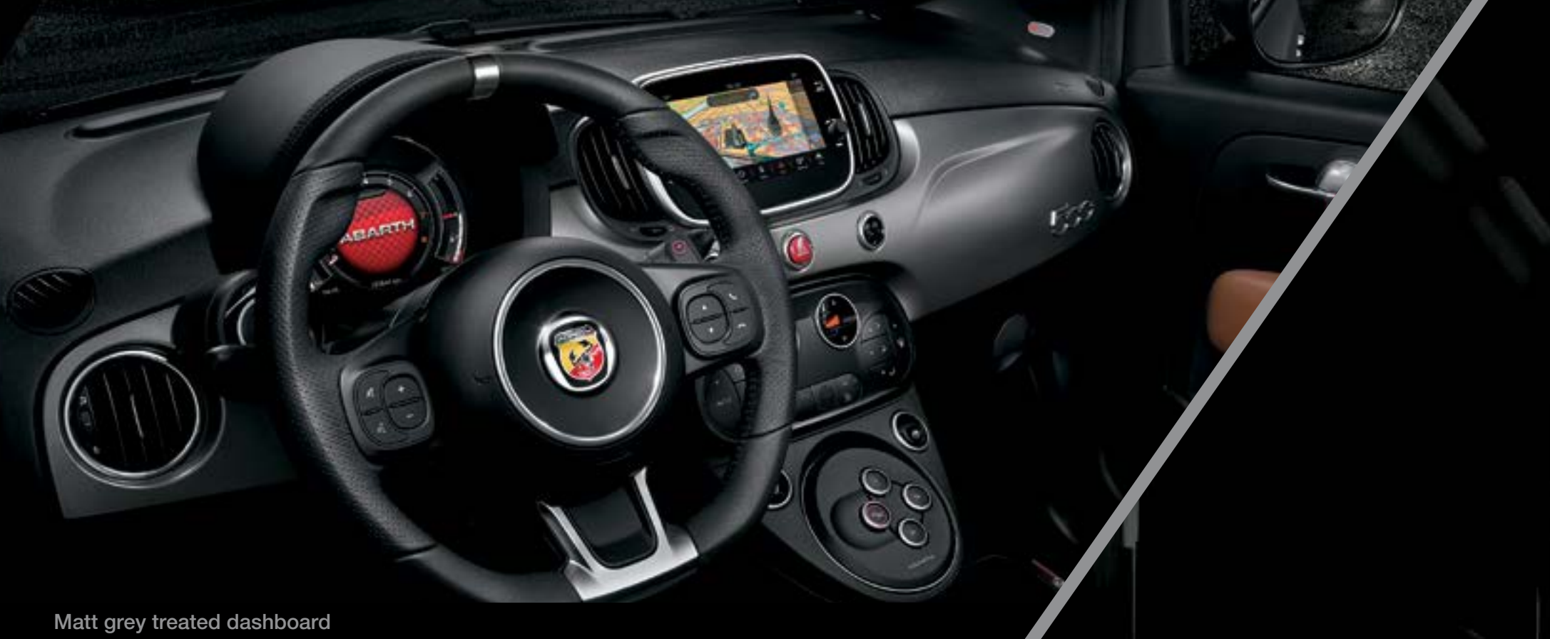
Matt grey treated dashboard