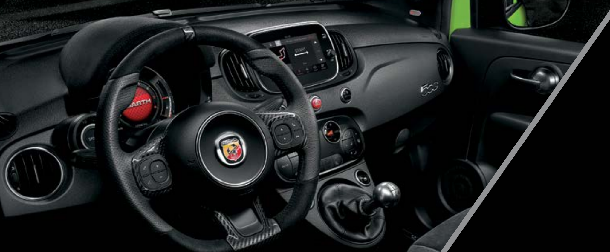
Radio touch 7" with Apple CarPlay / Android Auto™