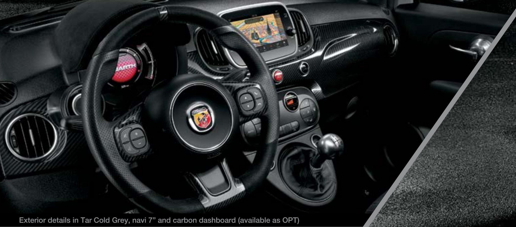
Exterior details in Tar Cold Grey, navi 7" and carbon dashboard (available as OPT)