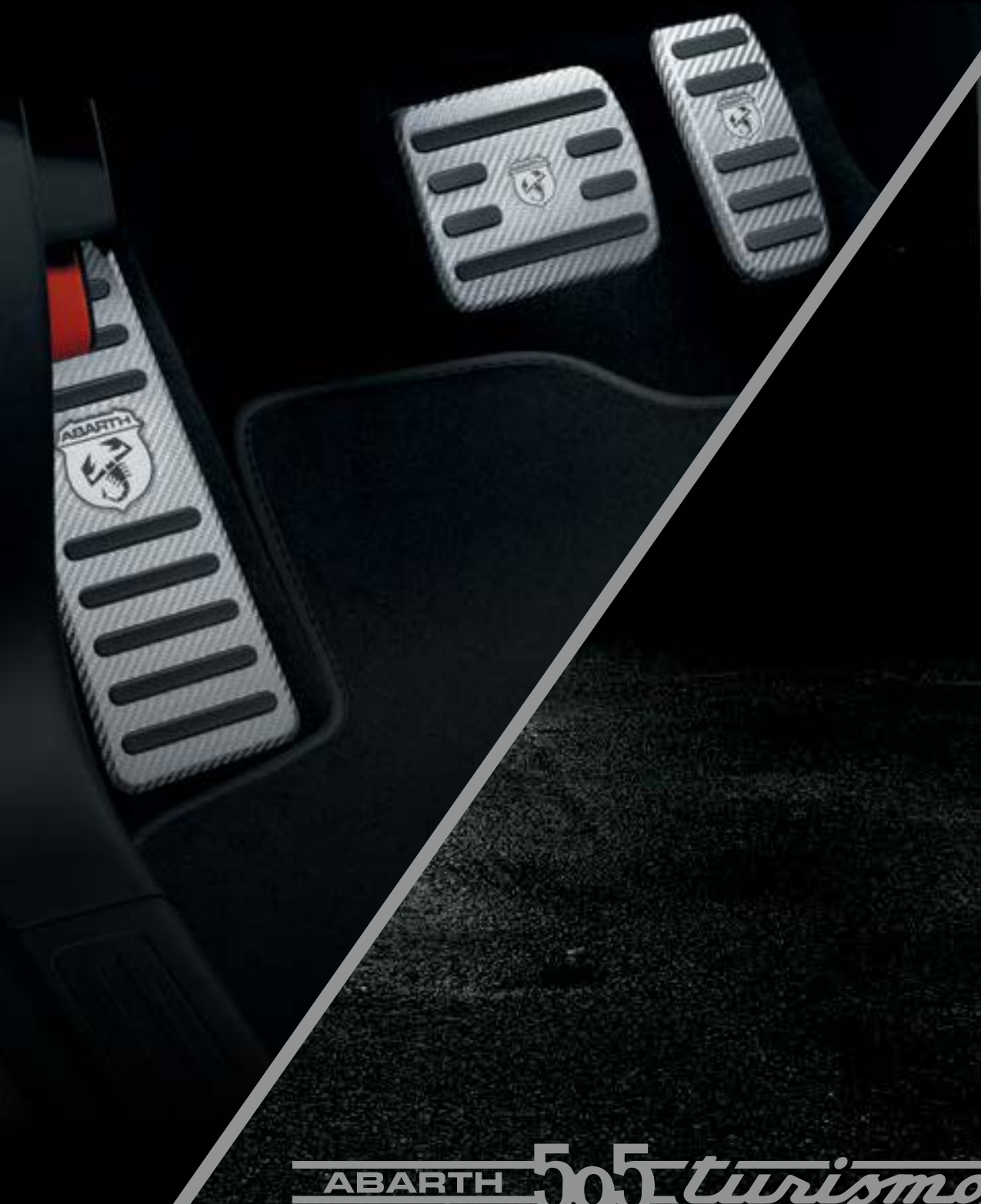
Sporty pedals in Alutex