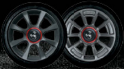
16" 8 SPOKES 16" HERITAGE