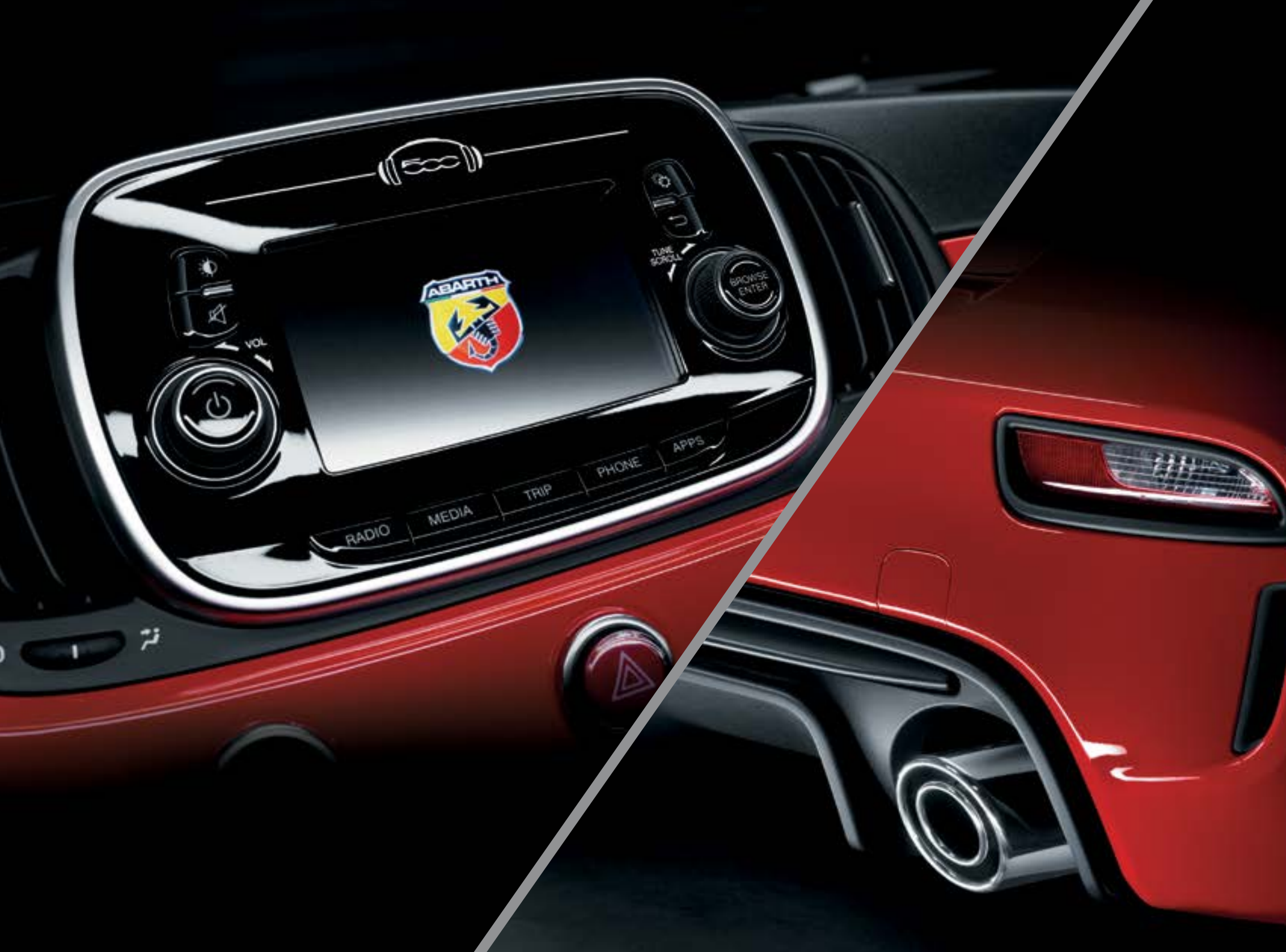
Uconnect™ 5" with steering wheel controls