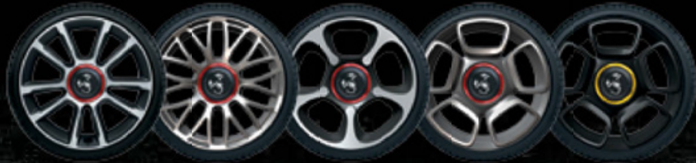
17" GRANTURISMO 17" TOURING 17" TROFEO 17" SPORT 17" SPORT MATT BLACK