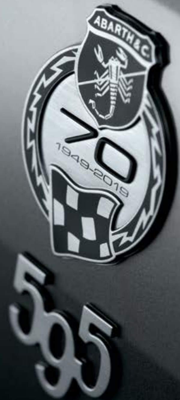
70 th Anniversary Celebrative External Badge