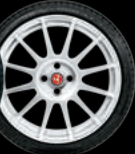
17" SUPERSPORT WHITE RACING