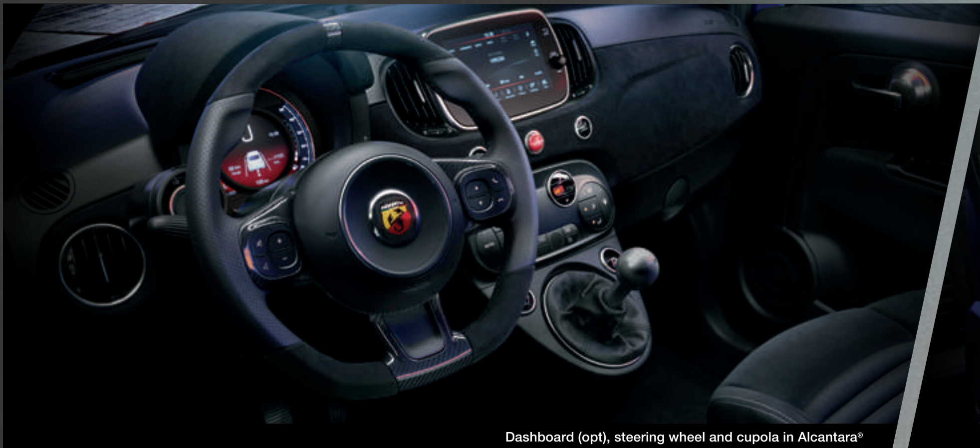
Dashboard (opt), steering wheel and cupola in Alcantara®