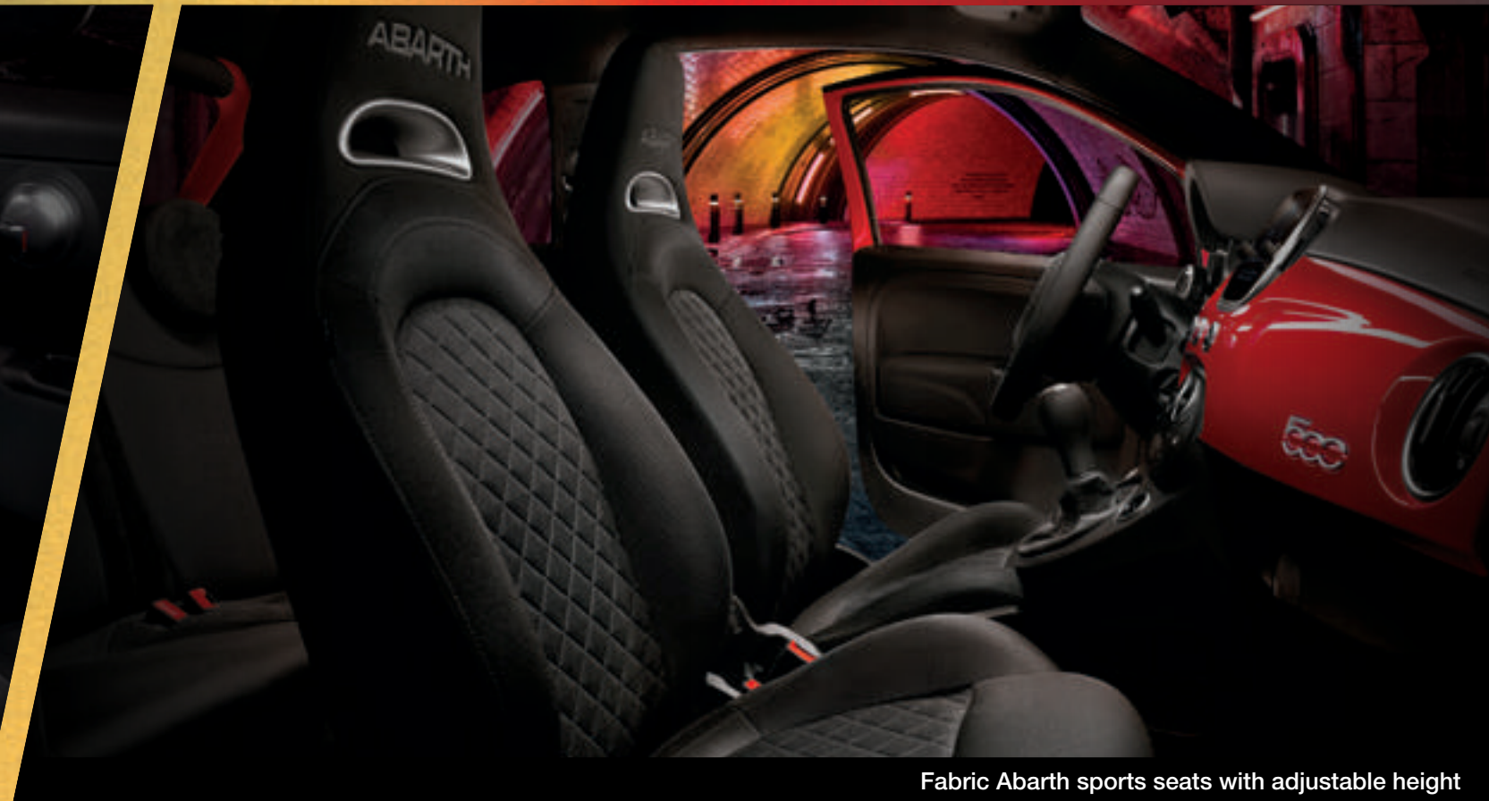
Fabric Abarth sports seats with adjustable height