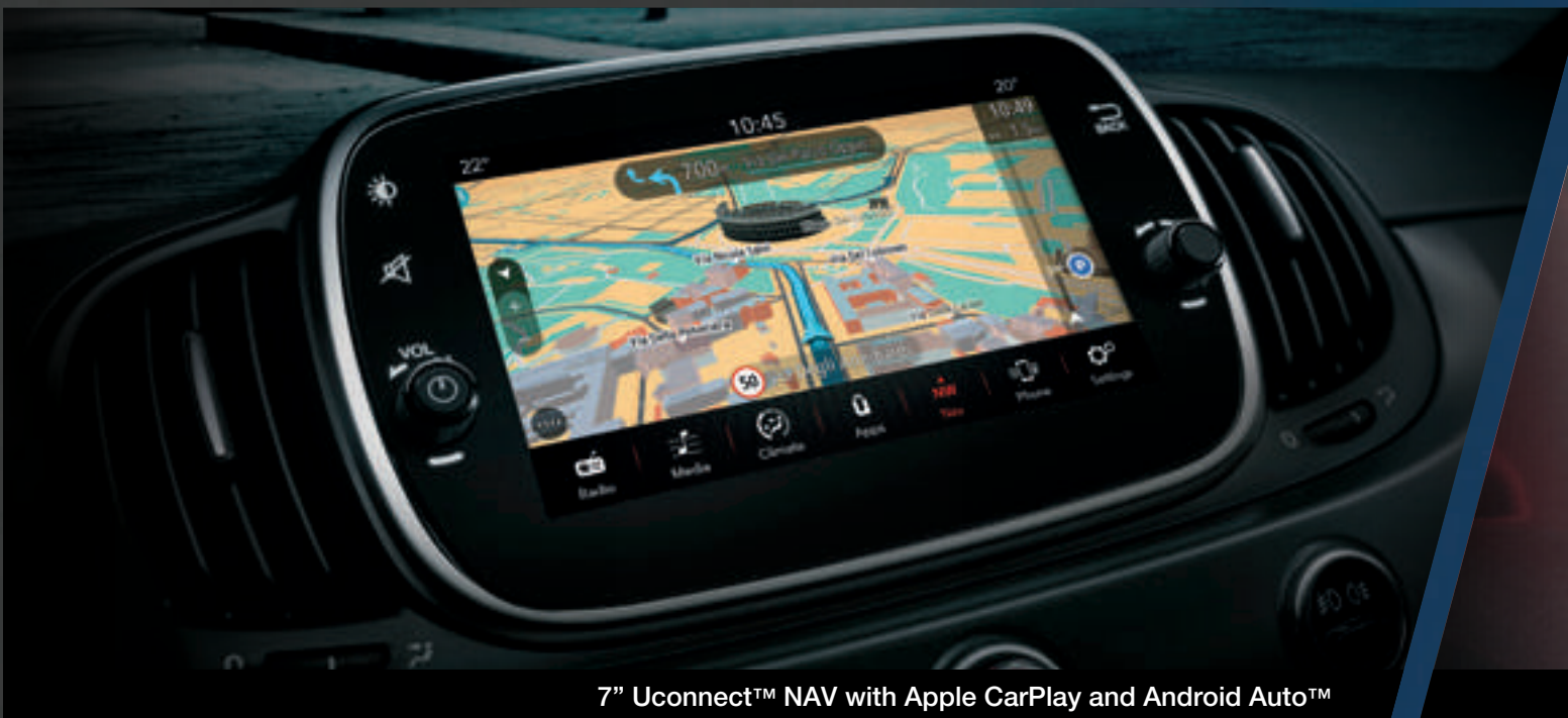
7" Uconnect™ NAV with Apple CarPlay and Android Auto™