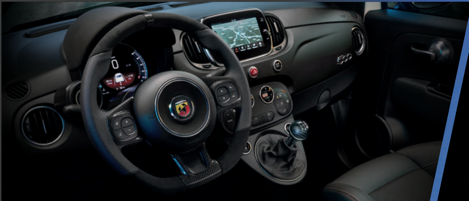
New anti-glare dashboard