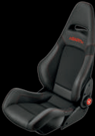
Carbon fibre Sabelt® Racing with carbon fibre shell (as standard on 595 essesse)

Designed to ensure race-worthy lateral holding. Ideal to become one with the car and get the most out of sports driving.