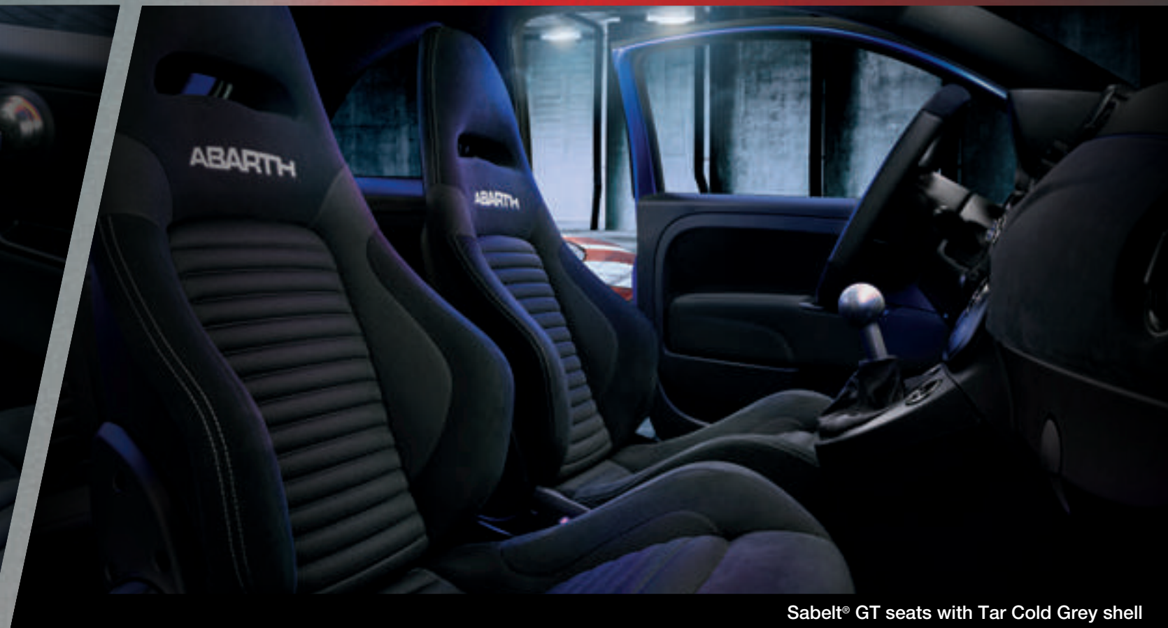
Sabelt® GT seats with Tar Cold Grey shell