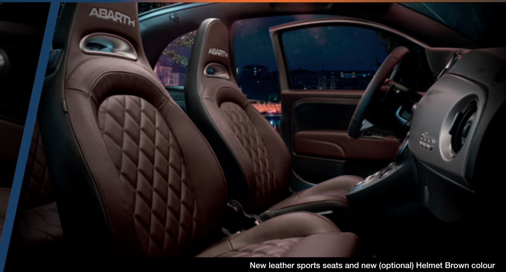
New leather sports seats and new (optional) Helmet Brown colour