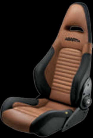
Tobacco leather Sabelt® GT (optional on 595 Turismo and 595 Competizione)

Ensures great lateral holding and unique comfort, even on long journeys.