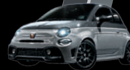
Pista Grey / Campovolo Grey