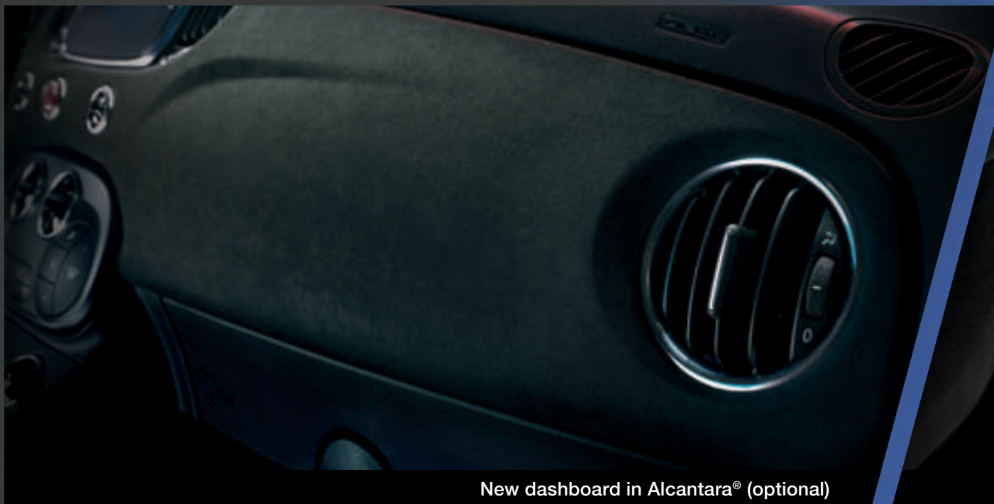
New dashboard in Alcantara® (optional)