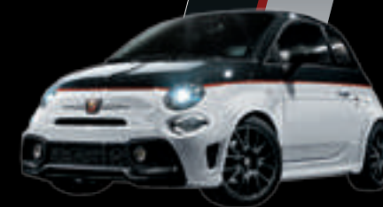
Scorpione Black / Gara White