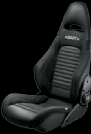
Black leather Sabelt® GT (optional on 595 Turismo and 595 Competizione)