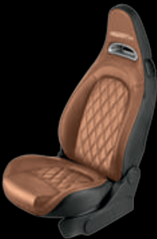
Natural leather (optional on 595, 595 Turismo and 595 Competizione)