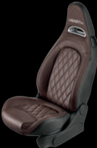
Helmet brown leather (optional on 595, 595 Turismo and 595 Competizione)