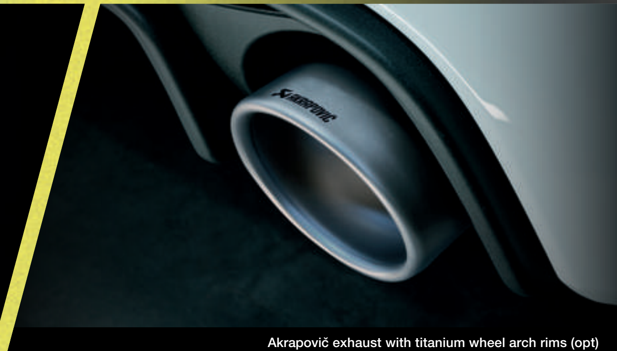
Akrapovič exhaust with titanium wheel arch rims (opt)