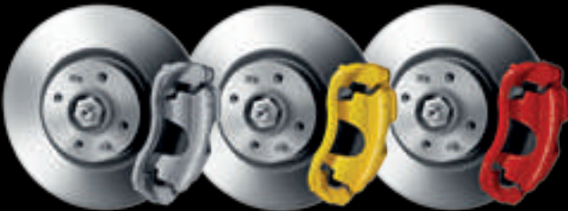
Unpainted brake calipers (as standard on 595)