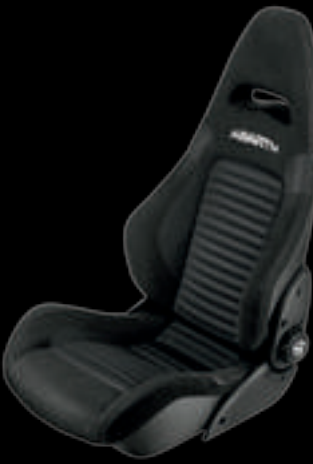
Fabric Sabelt® GT (as standard on 595 Competizione)

Designed to ensure race-worthy lateral holding. Ideal to become one with the car and get the most out of sports driving.