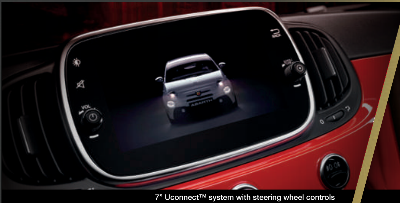
7" Uconnect™ system with steering wheel controls