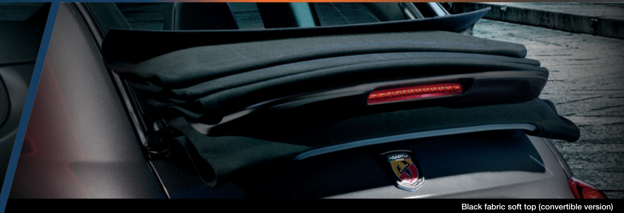
Black fabric soft top (convertible version)