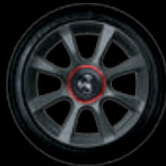
16" 8 SPOKES

• as standard ○ optional - not available