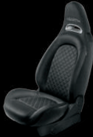
Black fabric (as standard on 595)