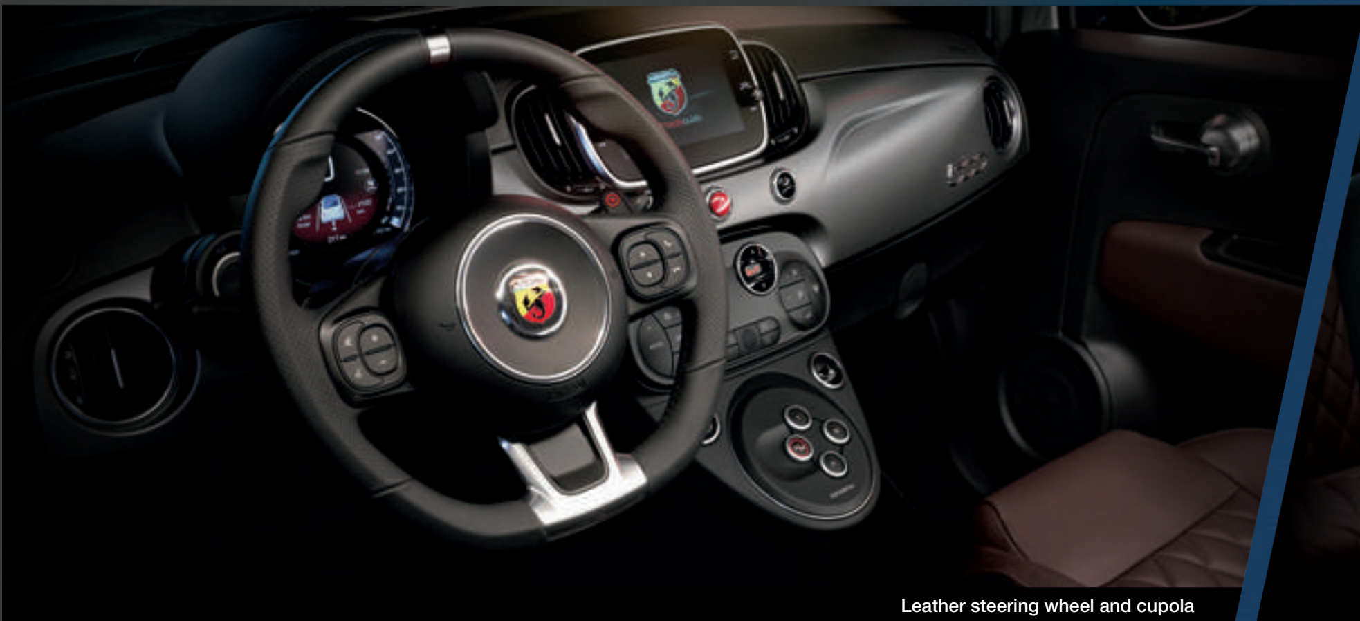
Leather steering wheel and cupola