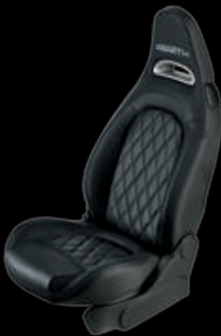
Black leather (as standard on 595 Turismo)