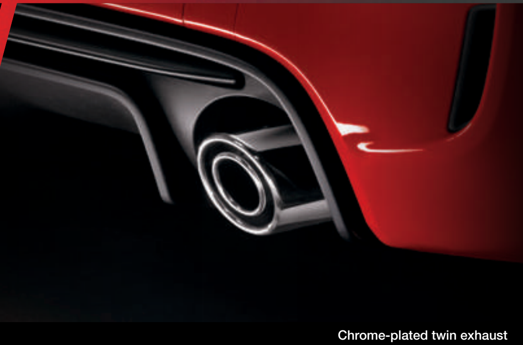
Chrome-plated twin exhaust