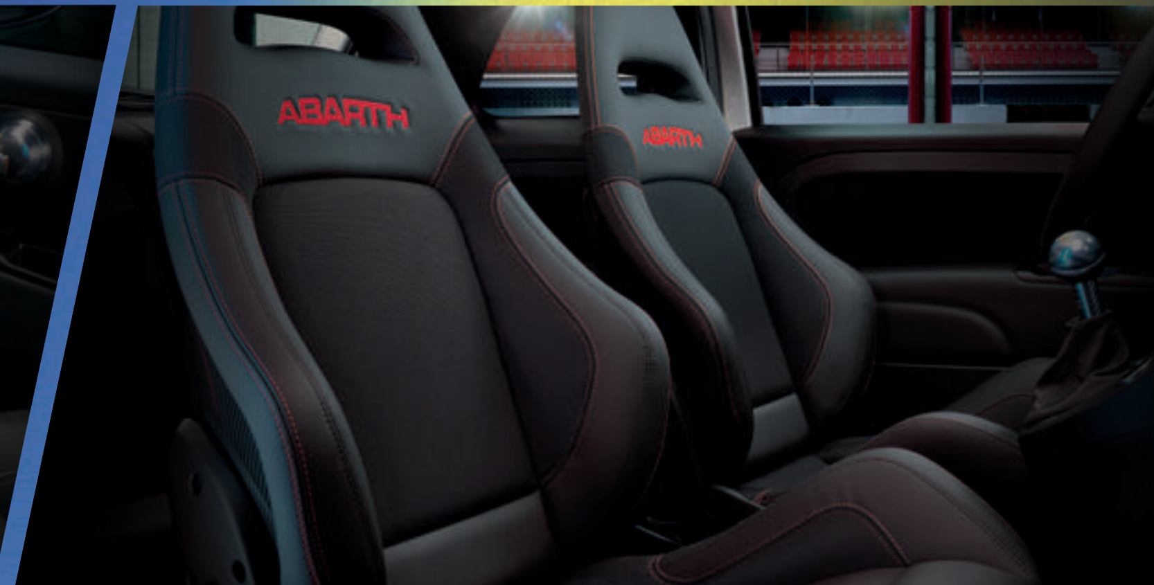
Sabelt® Racing seats with carbon fibre shell