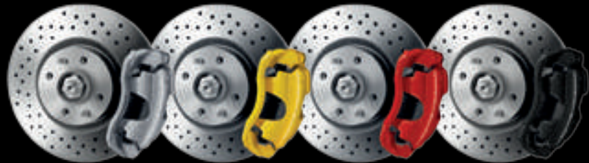
Grey (as standard on 595 Turismo)