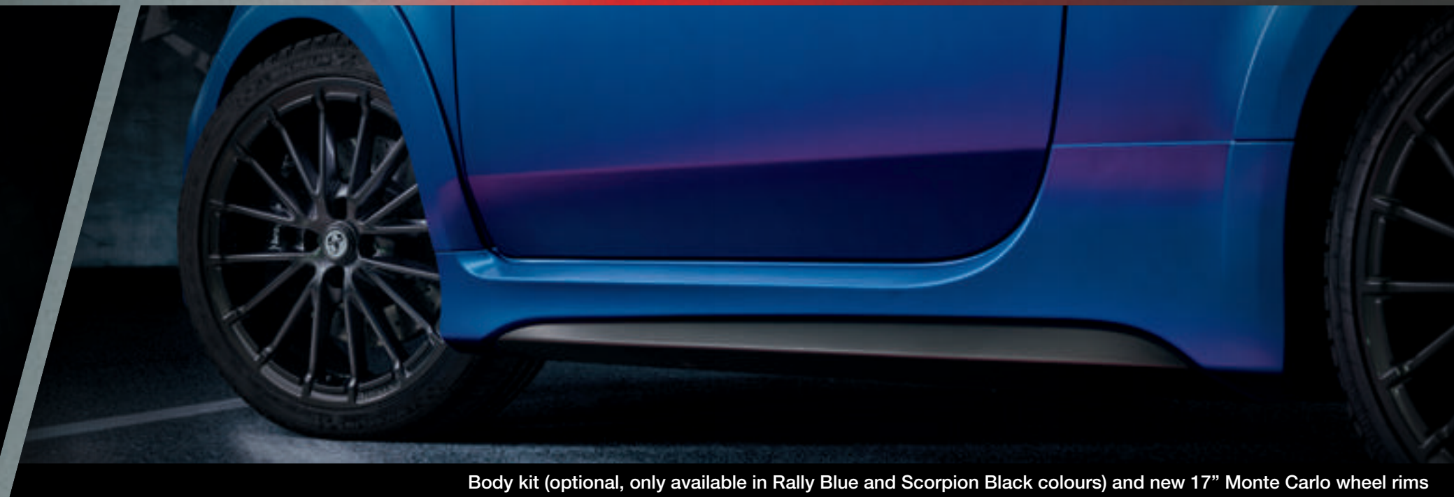
Body kit (optional, only available in Rally Blue and Scorpion Black colours) and new 17" Monte Carlo wheel rims