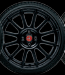
17" SUPERSPORT MATTE BLACK