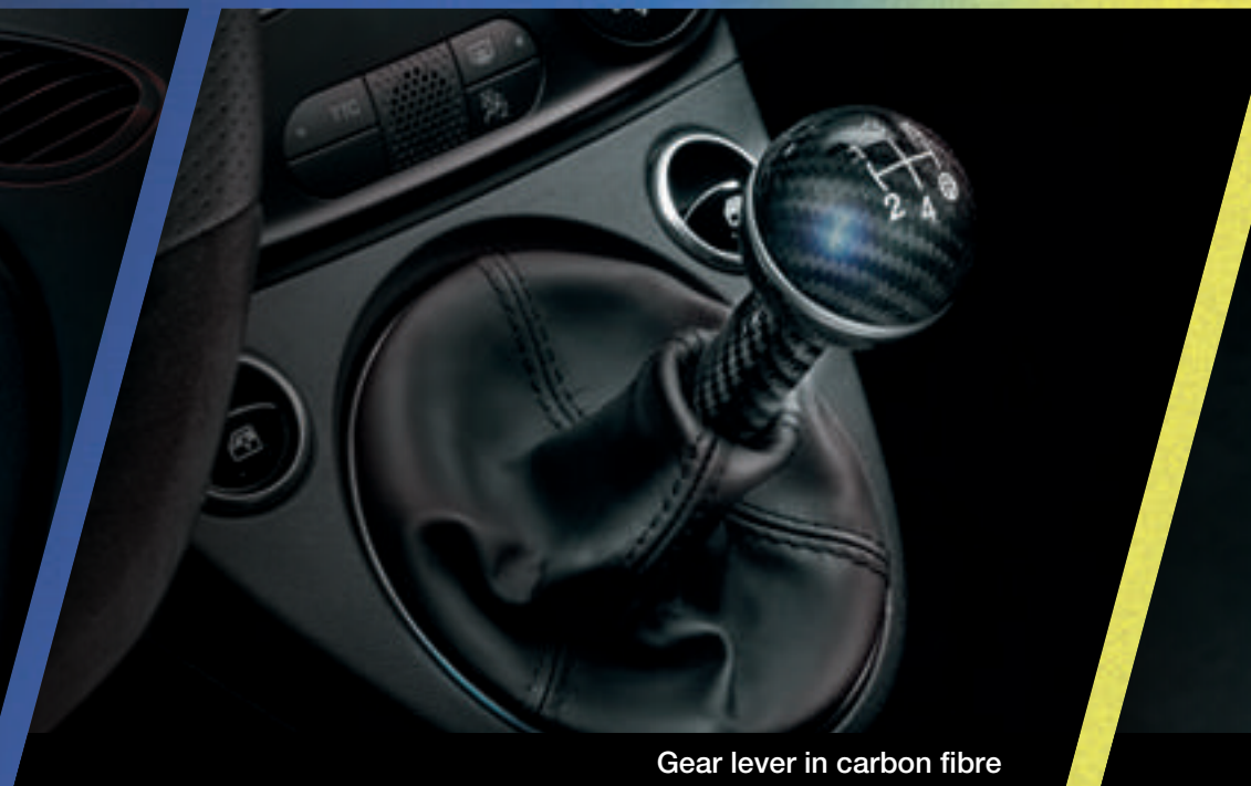
Gear lever in carbon fibre